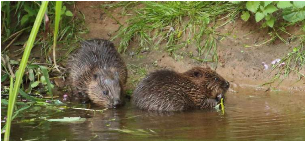
Beaver kits